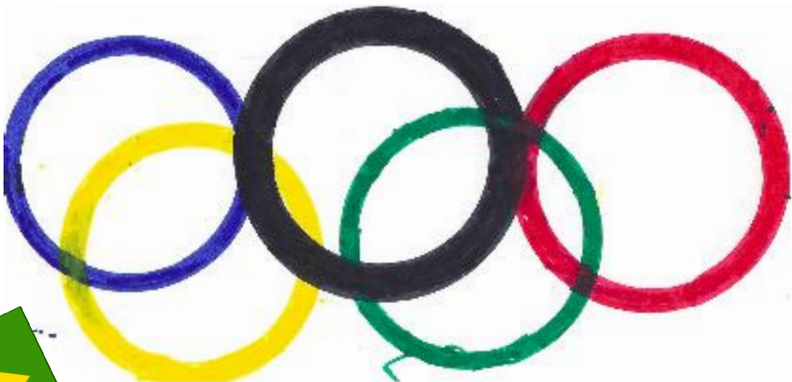
Illustration by Enzo

The ancient olympics took place in Greece around 776 BC. We think a good film to see an example of this is Asterix and the Olympic Games . We think it gives you a good idea of what the olympics games were like.